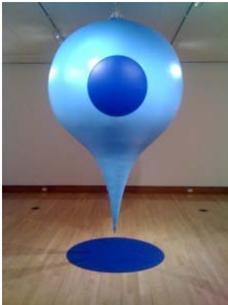
Free WiFi at the Cambridge Arts Council.