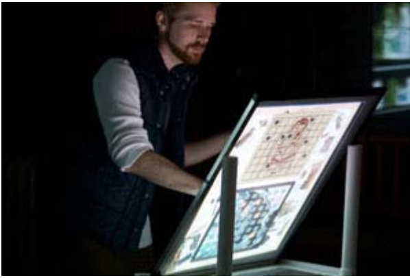
mtn & touchscreen

TODAY, Monday, April 25, 9pm-1am, Enormous Room , Cambridge. Free.