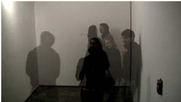
Motion-tracking software activates the installation.