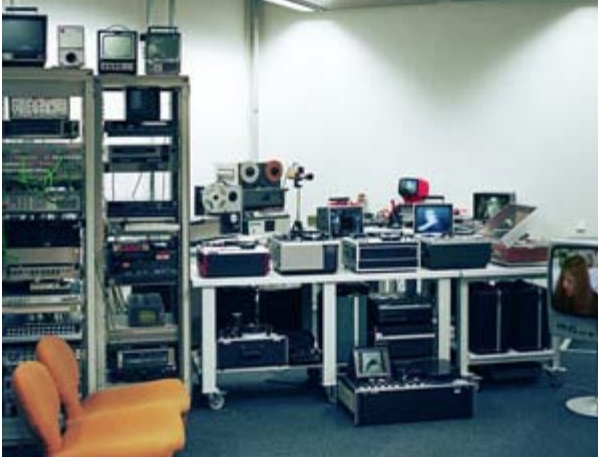
RECORD > AGAIN! - 40 Years Video Art in Germany, Part 2 Video Laboratory