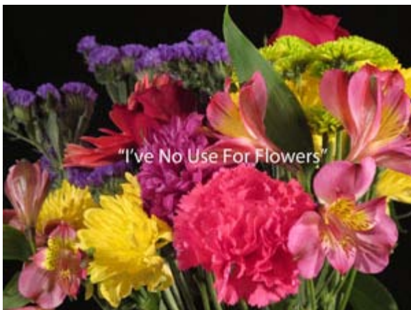
I've No Use for Flowers