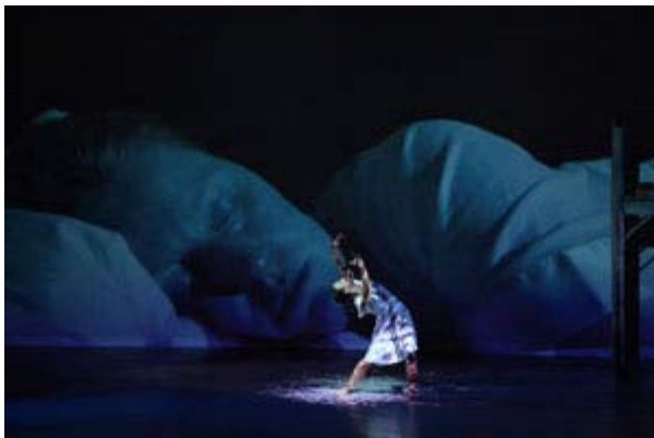
Blinking , Lostwax Multimedia Dance