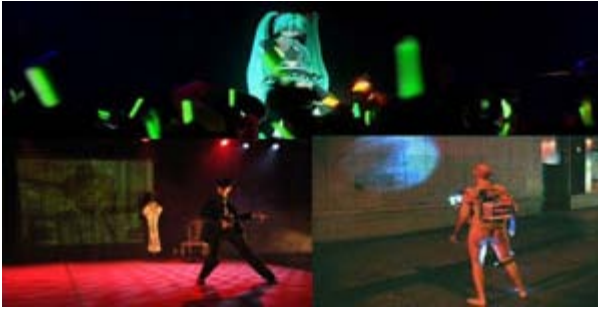
Images from Dance Technology