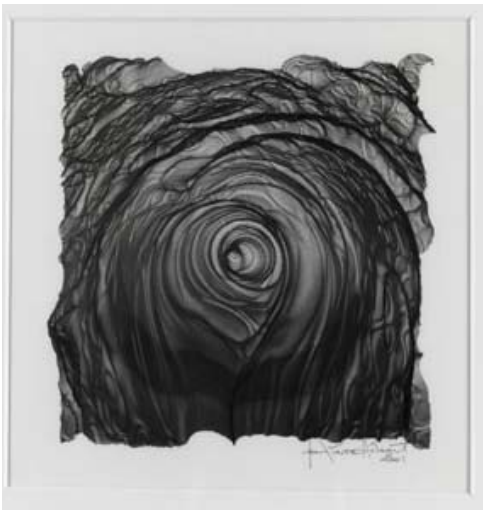
Untitled, Jean-Pierre Hébert, pen and ink (plotter), 2001